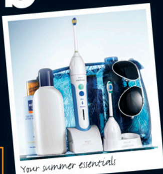
Your summer essentials