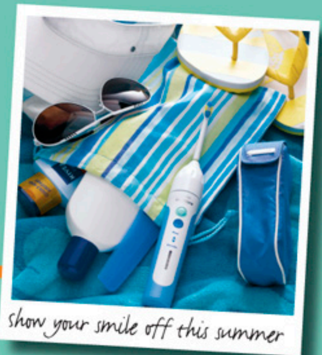
Show your smile off this summer

Heading for the sun? Then make sure you look your best on the beach with these little holiday helpers