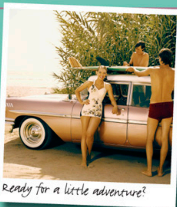
Ready for a little adventure?

You know what they say: clothes maketh the man. So make sure yours emerge from your case in pristine condition. Start by making a checklist of what you need, lay everything out on your bed in outfits and discard anything you'll only wear once. Pack tightly to prevent movement and use tissue paper or dry-cleaning bags between layers to prevent creasing. If you're a stranger to an iron go for checks (they don't show the creases as much!) and stick to neutrals like black, white and beige which tend to be more versatile. Roll T-shirts and jeans and unpack as soon as you get to the hotel to prevent further wrinkles.