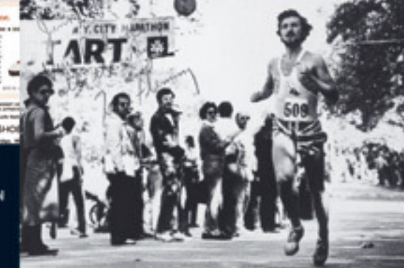
1970s: TOM FLEMING WINS THE 1975 NEW YORK CITY MARATHON IN A PAIR OF NEW BALANCE 320s. THE SHOE GETS FIRST PLACE RANKING IN THE 1976 RUNNER'S WORLD AWARDS.