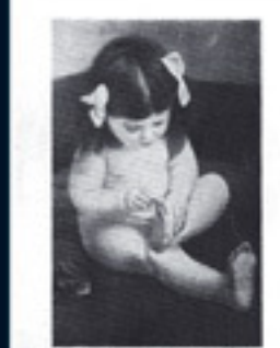
READ INSIDE FACTS

Scientifically Designed - Light Weight - Soft and Flexible - All Sizes Relieves Pain Restores Foot Health