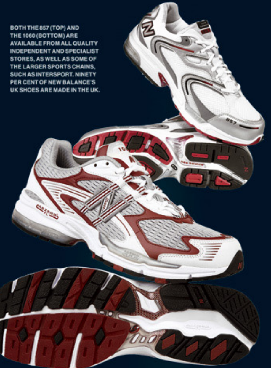
BOTH THE 857 (TOP) AND THE 1060 (BOTTOM) ARE AVAILABLE FROM ALL QUALITY INDEPENDENT AND SPECIALIST STORES, AS WELL AS SOME OF THE LARGER SPORTS CHAINS, SUCH AS INTERSPORT. NINETY PER CENT OF NEW BALANCE'S UK SHOES ARE MADE IN THE UK.